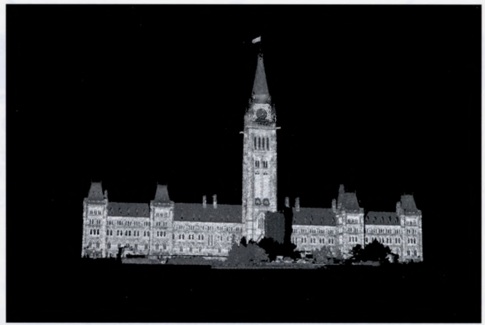
Combination of four scans

The system itself is portable and sits inside a box approximately 1ft x 1ft x 8 inches and mounts onto a standard surveying tripod. (It's preferable that the unit is roughly level, but the unit does not have to be absolutely perpendicular to the ground.) Its rechargeable battery will operate for up to five hours. The Optech laser operates in the infrared end of the electromagnetic spectrum, so there is no visible light but unlike the airborne systems, which are dangerous at close range, the beam used by the ILRIS is completely eye safe. The unit specifications say it will work from three metres to more than 500 metres from the scene or object to be surveyed, but Northway Photomap's general manager, Paul Francis, says that under the right conditions it can be used to scan objects up to 800 or more metres away. However, the scan angle or angle of view is 40 degrees in both horizontal and vertical directions ( \pm 20^\circ from nadir), so at longer distances, the effective scene coverage is large, and individual point spacing becomes