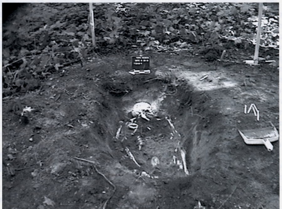
Forensic dig - a shallow grave

But what sort of time is really involved? Paul provided the following times for a project completed at Toronto's Pearson International Airport where depressions in the tarmac were causing problems. Four scans were made, each of 14 minutes duration. The total field time was four hours including getting everything through security and set up. The client wanted the data georeferenced, so four